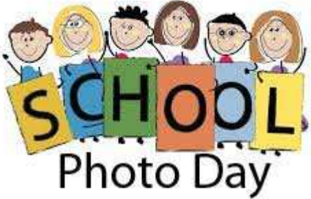
Photo Day Wednesday 16th August

Creative Workshops for Kids - Ages 8 and up...